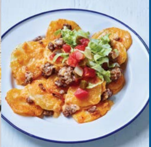
Cheesy Taco Potatoes

VEGETARIAN CHILI +64% 4-year growth at K12*