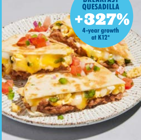
Huevos Rancheros Quesadilla

BREAKFAST QUESADILLA +327% 4-year growth at K12*