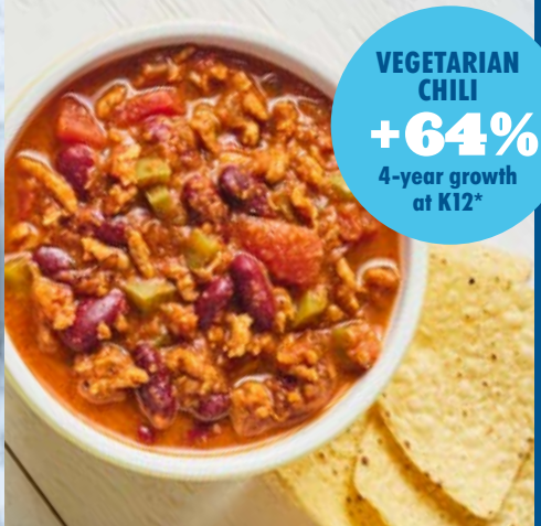
Southwest Vegetarian Chili