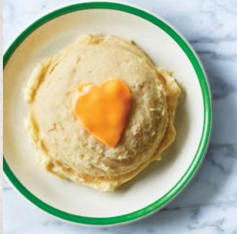
Cheesy Potatoes of Love